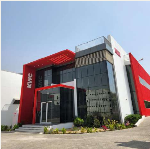
KWC ME Headquarter & Manufacturing facility at Ras Al Khaimah, UAE

KWC is a renowned global company specializing in innovative and resource-efficient water management systems: fittings & system solutions for private households, public commercial facilities & medical sector. With a robust presence in the Middle East, KWC boasts a vast production facility and cutting-edge technology to cater to specific demands in the region. The company prides itself on a legacy of Swiss craftsmanship and a rich history spanning 150 years. With three operational sectors namely KWC Home, KWC Professional & KWC Medical, we spread our expertise across two continents with six major production sites. KWC Middle East specializes in accessories & fixtures made of stainless steel with Nano-coating specifically for (semi-) public & commercial sectors.